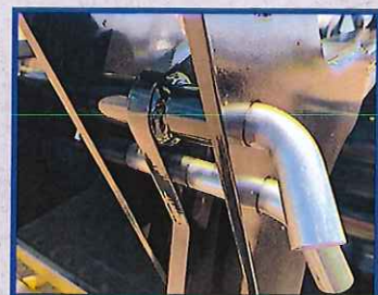
Flip up parking stands do not need to be removed when parking the grapple.