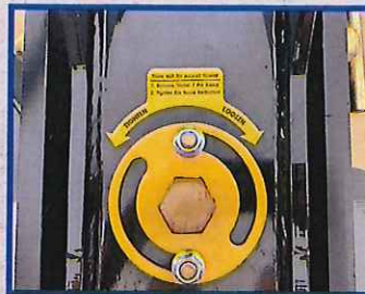
The patented Acme Threaded Jack Screw is used to adjust the retaining pin for easy removal.