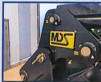
MDS is an advocate of grease and recommends good maintenance practices.