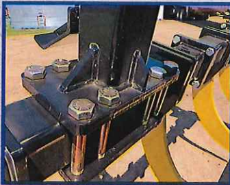
Sixteen (16) Grade 8 Bolts are used to keep the cross tube from sliding side to side.