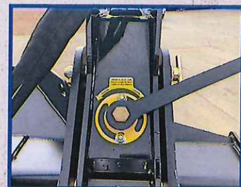
MDS furnishes a custom made wrench used to adjust the Acme Threaded Jack Screw.

MDS has owned the bucket/grapple market since 1976. For a complete new bucket and grapple combination ask about the Intimidator line of buckets and grapples from MDS.